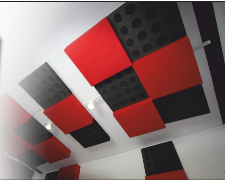
Image of 60x60cm model Ref.:WAL060 (on the left) and Ref.:WAL060 (ambient image).