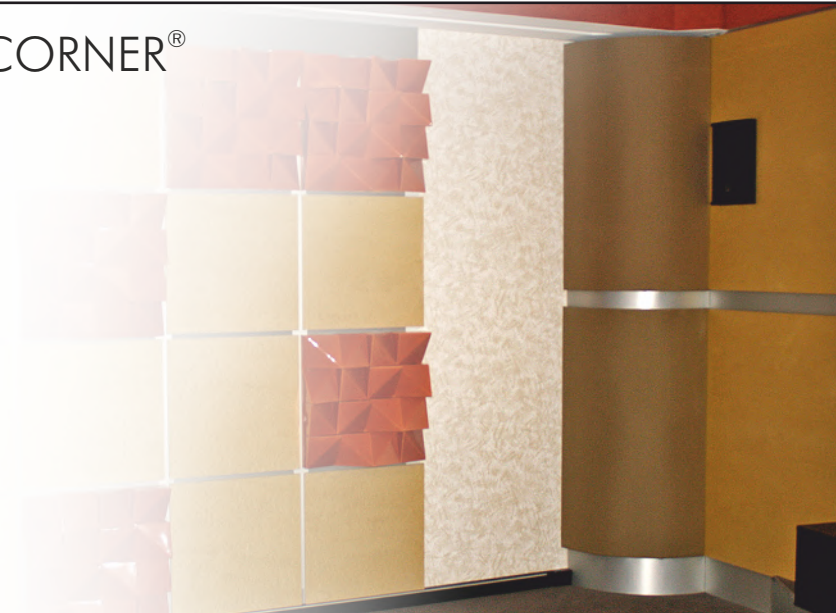
Image of 120x50cm model Ref.:RC0120 (on the left) and Ref.:RC0120 (ambient image).