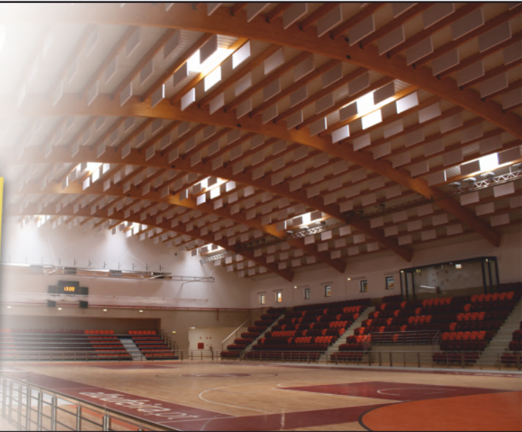
Image of 137x62cm model Ref.:MEW137 (on the left) and Ref.:MEW137 model applied (ambient image).