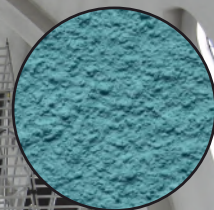
TEXTURE AND COLOUR EXAMPLE