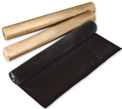
FLOATSHEET® VIB AD