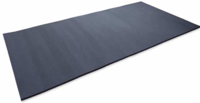
FLOATSHEET® INS PLATE

Image of FLOATSHEET® INS ROLL, Ref.:FINr010AD (on the left) and PLATE, Ref.:FINp010AD (on the right).