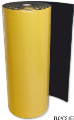
FLOATSHEET® INS ROLL